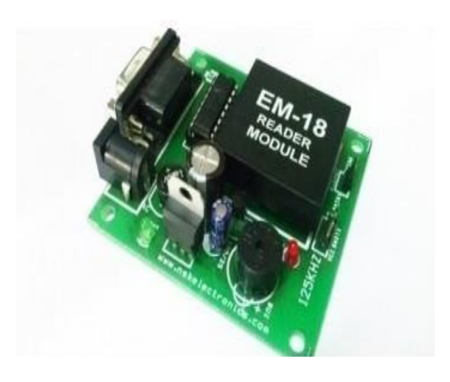
Fig 3.6 RFID READER 3. CONCLUSION

information. [4] The image below is showing an RFID reader.