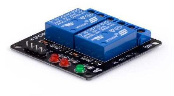
Fig 3.4: RELAY

A relay is an electrically operated switch. It consists of a set of input terminals for a single or multiple control signals, and a set of operating contacts