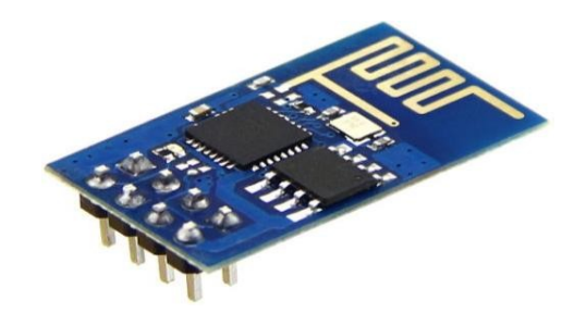
Fig 3.5 WiFi Module

ESP8266 is Wi-Fi enabled system on chip (SoC) module developed by Espressif system. It is mostly used for development of IoT (Internet of Things) embedded applications.