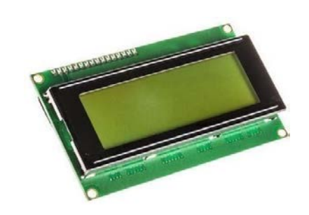
Fig 3.3 LCD333

This is the first interfacing example for the Parallel Port. We will start with something simple. This example doesn't use the Bidirectional feature found on newer ports, thus it should work with most, if not all Parallel Ports