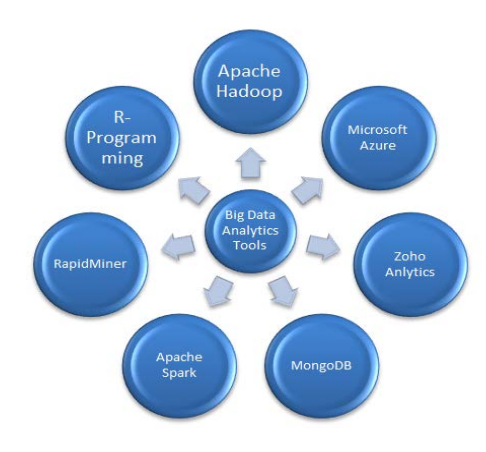
Figure 2: Tools of Big Data Analysis

This study shows the top tools used for big data analytics. Figure 2 shows the popular tools used [3][4][5] for big data analysis.