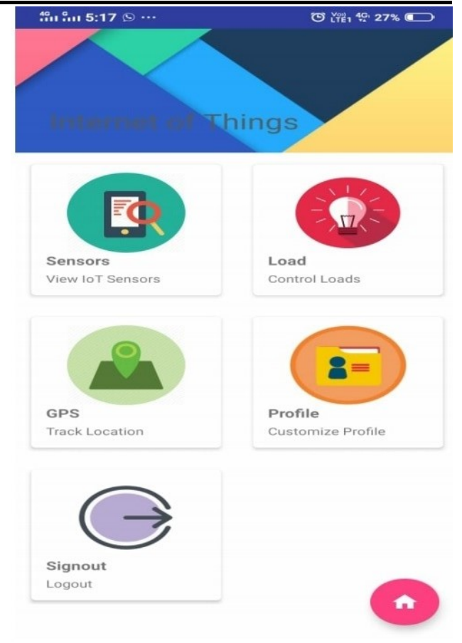
Fig 4: Various features in the application.

Fig 3: The first page of the application, which allows the user to register with a username and password of his/her choice.