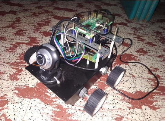
Fig 2: Hardware model

The proposed system has a power supply comprising a 12v battery, which is used to supply power to the raspberry pi 3, to which a supply of 5v power would be adequate. Thus the 12v is converted into 5v by the use of a voltage regulator which is placed in the power supply circuit using a TIP41 power transistor, which can provide a maximum of 4A in spec. However, in real time application, it can only provide a maximum of 2A. The transistor's body is TO-220 due to which it can easily be used as a heatsink of any size. The 7805 power regulator is faster than other models, because of its body being similar to that of TIP41 powertransistor, excluding the Zener diode and bias resistor.