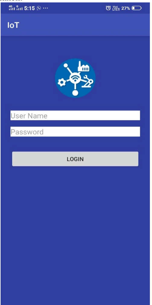
Fig 3: The first page of the application, which allows the user to register with a username and password of his/her choice.

A mobile application serves as the forefront of user interaction with the system. The response time of the child is recorded each time and this information is sent to the authorized personnel. The application is connected to the web server 24/7, enabling it to constantly upload data every few seconds. The application also enables tracking the live location of the robot at any given instant to determine where the test was taken.