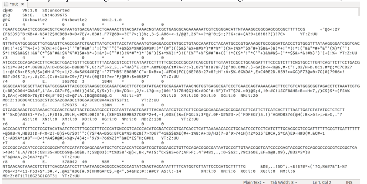
Figure E5: This screen shot shows the Mapped reads of E_coli.

The output consists of two sets of lines those printed to the "standard out" file handle and those printed to the "standard error" file handle. Each line printed to "standard out" is a valid reportable alignment found by Bowtie. A valid alignment is one that satisfies the alignment policy specified in the–n, –l, –eor–voptions. A reportable alignment is one that is not suppressed by any other option such as the–k, –m,or–Moptions. Lines printed to "standard error" contain summary information about the entire alignment run,