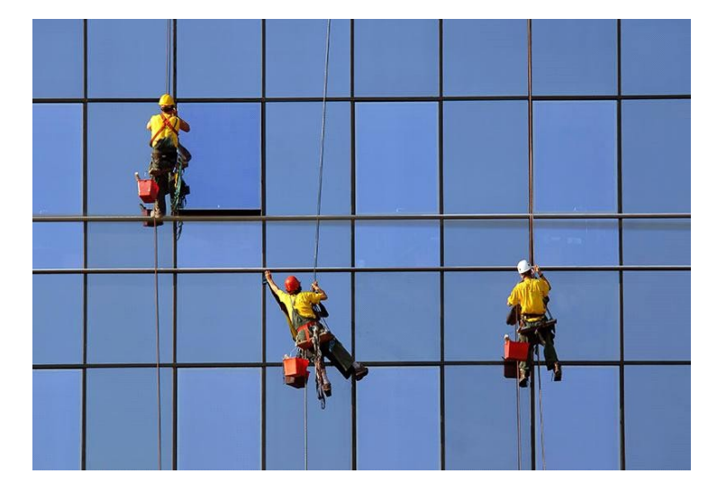
Figure 1: Workers cleaning windows by Abseiling Method