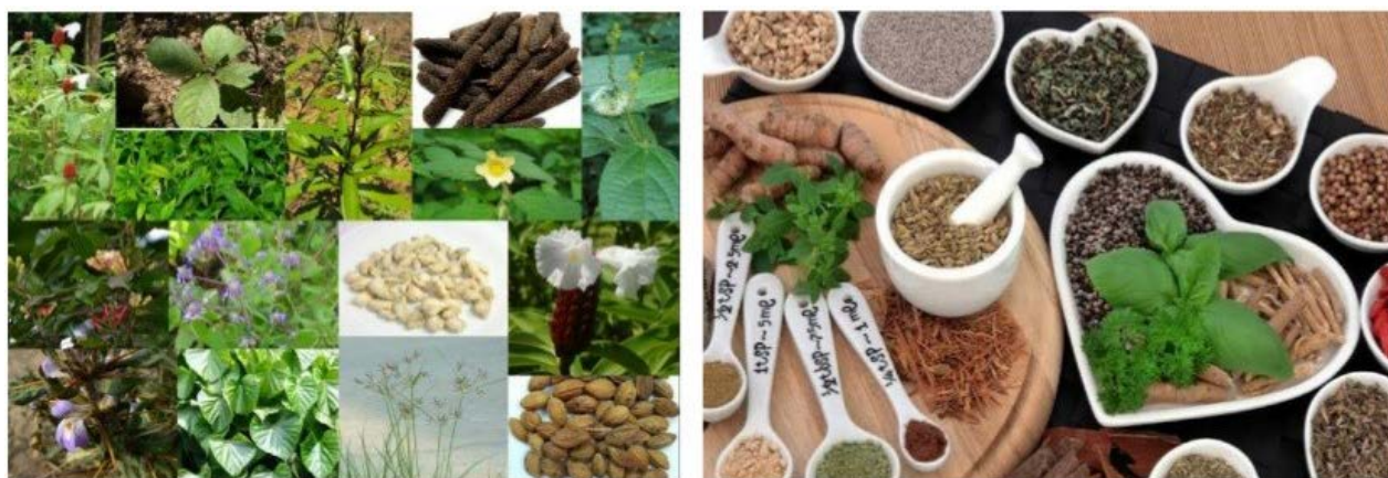
Figure: 4, 5. Ingredients in Kabasura Kudineer

The Churnam although in powdered form is generally ate up after infusing it in water and creating a decoction or kadha like consistency. The ingredients present in Kabasura Kudineer are Anacyclus pyrethrum (akkirakaram), Anishochillus carnocus (karpooravalli), Andrographis paniculate (Nilavembu), Clerodendrum serratum (siruthekku), Cotus speciosus (koshtam), Cyperus rotandus (koraikizhangu), Hydrophila auriculate (neermulli ver), Justica adathoda (Adathodai), Piper longum (thipilli), Sida achuta (vattathiruppi), Syzygium aromaticum (kirambu), Terminalia chebula (kadukkai), Tinospora cordifolia (seendhil), Tragus involugrate (sirukanchori ver), Zingiber officinate (chukku) [18].