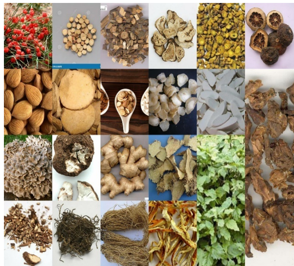
Figure:2, 3. Extract Ingredients for Qingfei Paidu

The general regulatory effect through the multi-goal and multi-thing components is to goal organ lungs. This system has the potential to dehumidification, fall of the spleen and belly, and protection of the kidney, heart and different organs. It acts on more than one ribosomal