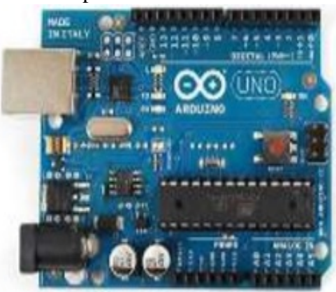
Fig. 2: Arduino Uno Microcontroller Development Board

The Adruino Uno board as shown in Fig. 2. The Table.2 shows the specifications of Arduino Uno microcontroller board.