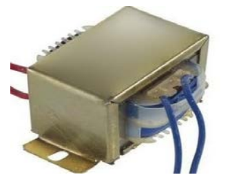
FIGURE 4. Transformer

decrease, depending on the efficiency of the transformer.