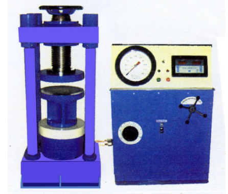
fig 1compression testing machine