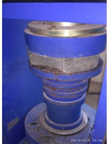
fig 2 compression test