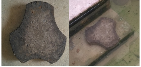
Fig 4Dry paver block