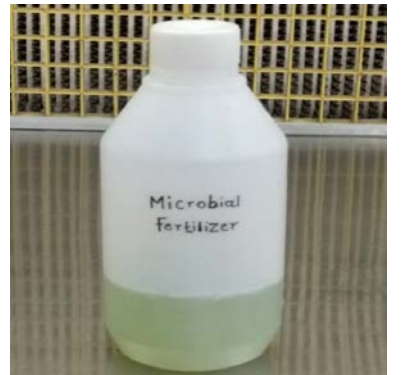
Fig. 4 – Microbial based fertilizer by using Pseudomonas strain

prepared with a addition of certain defined chemical and suitable additive which proved to be effective for a sustaining a shelf life of bacteria.