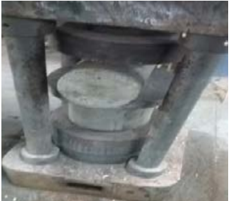
Fig.5.3 Specimen under Split Tensile Test