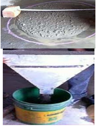
Fig. 5.1 Slump and V-funnel test