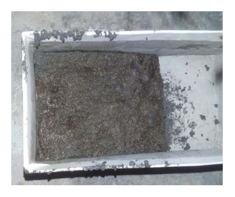
Figure 2: Final mould of brick composite paver

Compressive strength testing is a common performance measure for specimens under compression load; it provides immediate information of the bulk strength of the specimen begun tested. It is also an essential step for gaining critical insight into the potential