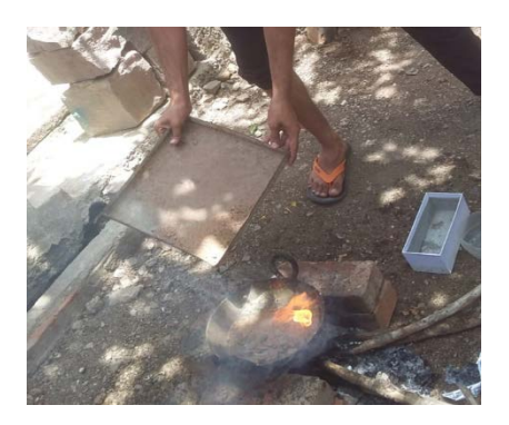
Figure 1:Composite preparation

In this work, a composite of plastic (LDPE & HDPE) is made with addition of sand for stabilization. This preparation of the composite is done through the method of heating the elements in single container mixed with the two materials until it melts. After this, this sludgy mixture is put into a block mould used for making pavers of about 60mm in dimensions. This mixture is incorporated by addition of sand particles for stabilization and given shape of a cuboid. Further the final mixture is left for cooling. After freezing, the specimen becomes prepared for the further testing. These types of method are quite simple and very basic to carry out without any much error.