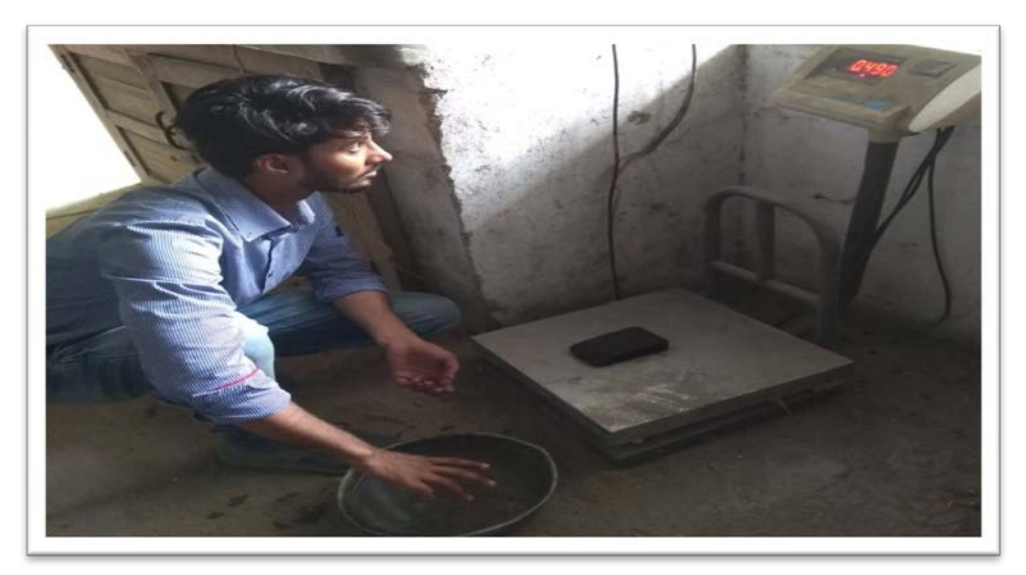
Figure 5: Weight of brick after immersion in water