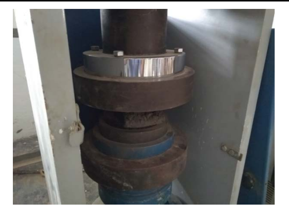
Figure 3: Compression testing apparatus