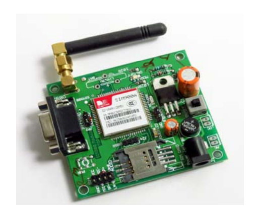
Figure 5. GSM modem.