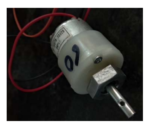
Figure4. DC motor.

DC motors were the first type widely used, since they could be powered from existing directcurrent lighting power distribution systems. A DC motor's speed can be controlled over a wide range, using either a variable supply voltage or by changing the strength of current in its field windings. Small DC motors are used in tools, toys, and applications. The universal motor can operate on direct current but is a lightweight motor used for portable power tools and appliances. Larger DC motors are used in propulsion of electric vehicles, elevator and hoists, or in drivers for steel rolling mills. The advent of power electronics has made replacement of DC motors with AC motors possible in many applications.