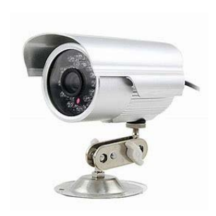
Figure7. Advanced Camera.

Wireless security cameras are closed-circuit television (CCTV) cameras that transmits a video and audio signal to a wireless receiver through a radio band. Many wireless security cameras require at least one cable or wire for power; "wireless" refer to the transmission of video/audio. However, some wireless security cameras are battery-powered, making the cameras truly wireless from top to bottom.