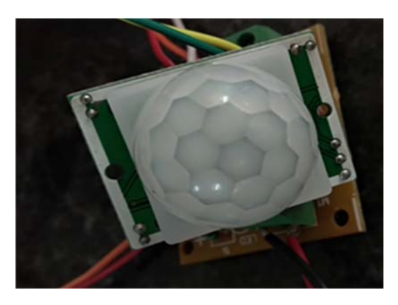
Figure3. PIR sensor.

They are small, inexpensive, low-power, easy to use and don't wear out.