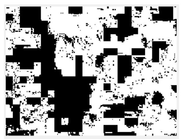
Fig.6 Morphological image