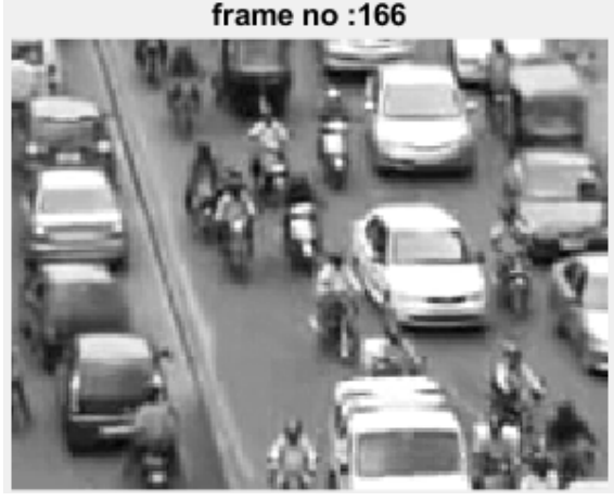
Fig.2 Extracting Frames from video sequence