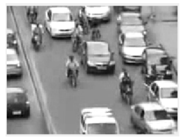
Fig.1 Original Image

Simulation is performed using MATLAB Software. This is an interactive system whose basic data element is an array that does not require dimensioning. It is a tool used for formulating solutions to many technical computing problems, especially those involving matrix representation. This tool emphasizes a lot of importance on comprehensive prototyping environment in the solution of digital image processing. Vision is most advanced of our senses, hence images play an important role in humans' perception, and MATLAB is a very efficient tool for image processing.