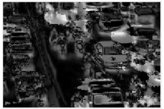
Fig.4 Grayscale of the frames