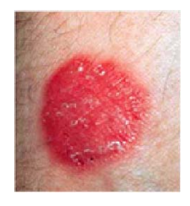
Fig. 2 Input image for Segmentation

The skin image is given as input. Fuzzy k-means clustering algorithm is applied on the image. The segmentation helps in extracting the lesion region, the output of fuzzy k-means clustering is shown in Fig. 2