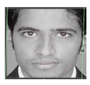
Fig4.2: Result Of Face Indexing

2) Face Matching is called as the second step of the process as it comes into the picture after the first step called as Face indexing. Face indexing converts cores of data into limited number of data so that limited number of data works as the input for the face matching scenario.