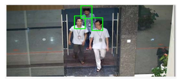
Fig3.1: Home Usage Environment

administrator have the authority to allow that person to enter in the house or to deny the access. It contains the ideal solution for the home usage.