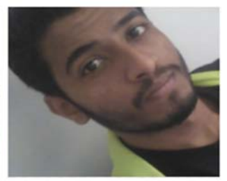
Fig4.2: Light Problem

For solving that type of problems we crease a scenario in which we get all side of data in every type of light for a single employee. That thing increases our database to match with the input: So again our whole system takes time to generate the input because as per increase of database it also increases time to compare data with every entry. So our whole system become time consuming and it take around 10-15 seconds to generate the output. Now while employee pass from the IP camera range in no having 10 to 15 seconds. So it contains as the base point 10 Crease a system that wok on the same flow but contain low time. For that we need to increase performance of our both the steps.