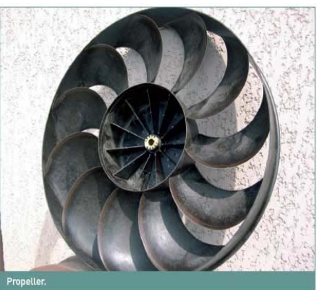
Fig 15: FRP Propeller

European production of flax and hemp fibers <sup>[3]</sup> is in competition with the world's major exotic plant fibers such as cotton, jute, ramie, sisal, raffia, etc., and synthetic fibers such as glass or polyamide fiber.