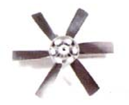
Fig 13: Energy Efficiency FRP Axial Flow Fans

The project was launched in partnership with M/s. Parag Fans & Cooling Systems Ltd., Dewas <sup>[4]</sup>. The technology Support in terms of aerodynamic design of axial flow fan impellers.