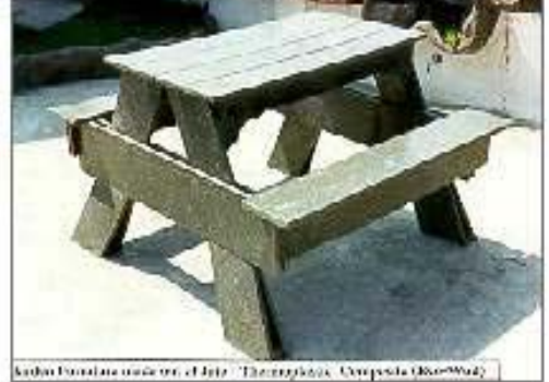
Fig 6: Garden Furniture