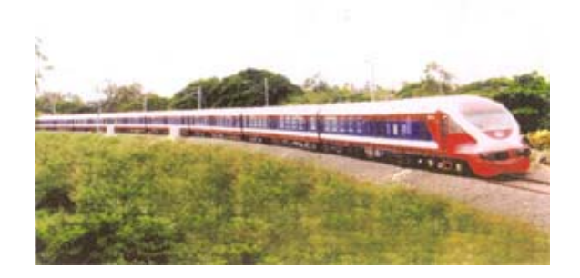
Fig 10: Gear Case Railway Locomotives FRP SLEEPERS FOR RAILWAY GIRDER BRIDGES

The project was done at M/s. Permali Wallace Ltd., Bhopal with technology support from the Regional Research Laboratory, Bhopal.