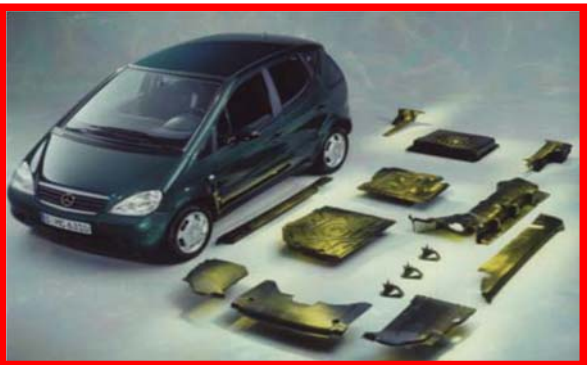
Fig 17: Interior parts of the Mercedes A-200 reinforced by natural fibers