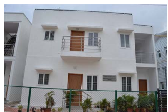
Fig 9: Composites Police House Constructed In Bangalore