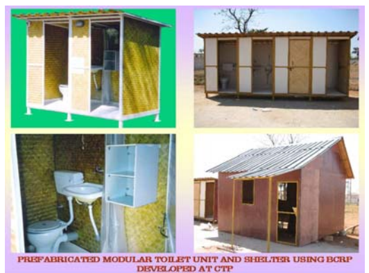
Fig 4: Bamboo Composites Products