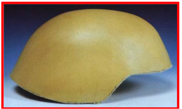
Fig 18: Lightweight composite military helmet