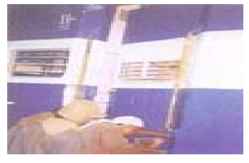
Fig 14: FRP Doors for Railway Coaches

Industries, Chennai & technology support from IIT-Bombay.