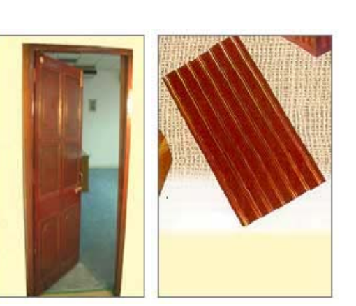
Jute Composite Door Jute Composites Corrugated Sheets a 5: Coir Pamboo Compositor Door Shutter