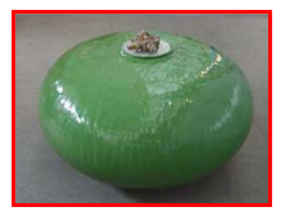
Fig 19: Filament winding Composite LPG container vessel