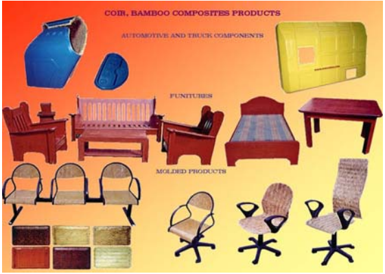
Fig 2: Coir-Bamboo Composites