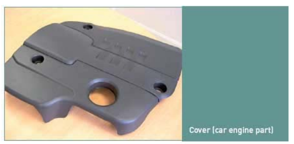
Fig 16: FRP for car engine part

electrical and electronic goods, and aerospace, boatbuilding, and consumer products.