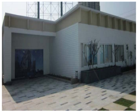
Fig 8: Composite House – Mockup Flat For Marketing Office in Bangalore