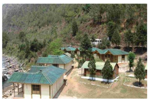
Fig 3: Bamboo Composites Huts