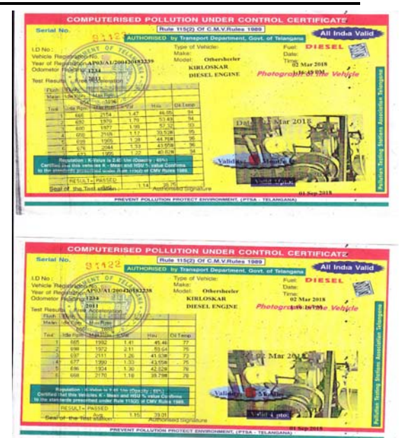
Fig 3: Emissions Result