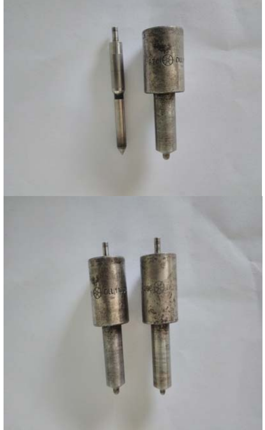
Fig 1: General appearance of a Nozzle