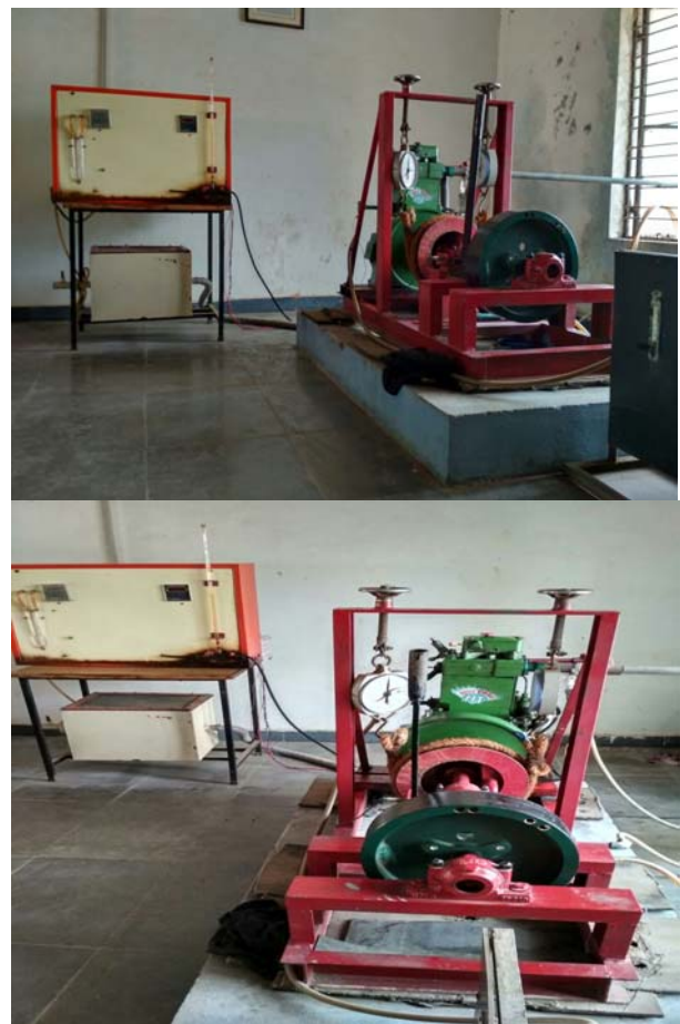
Fig 2: Experimental Setup