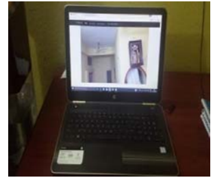
Fig4: Video using IP CAM Application

As the blimp rotates, it captures the video of the outer area in the direction given at the input by the user. Adjusting balloon position and camera position is to record the required area of the room. The Remote controlled balloon for surveillance system thus now ready to capture images and videos successfully.