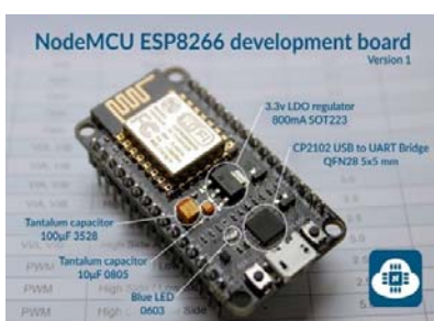
Fig 3: ESP8266-12E board Description

ESP8266 is an impressive, low cost WiFi module suitable for adding Wi-Fi functionality to an existing microcontroller project via a UART serial connection. The module can even be reprogrammed to act as a standalone Wi-Fi connected device—just add power! The feature list is impressive and includes: 802.11 b/g/n protocol Wi-Fi Direct (P2P), soft-AP Integrated TCP/IP protocol stack.