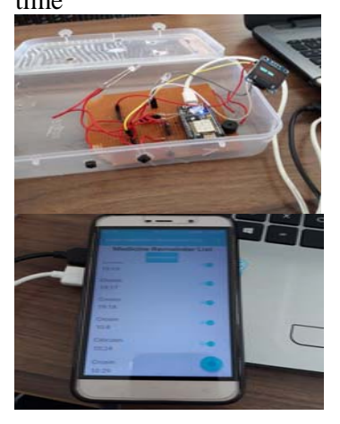
Fig 2: pill box with hardware connections

The OLED are used to display the commands in pill box by Node MCU. Node MCU is inbuilt with Wi-Fi module. The Wi-Fi module is configured as PILL BOXAP, such that the IP address is generated in local network.by pairingthe IP address generated by PILLBOXAP to the Mobile App. The configuration data is send to the smart pillbox when the configuration is in ON mode. The concerned LED glow with buzzer at schedule time