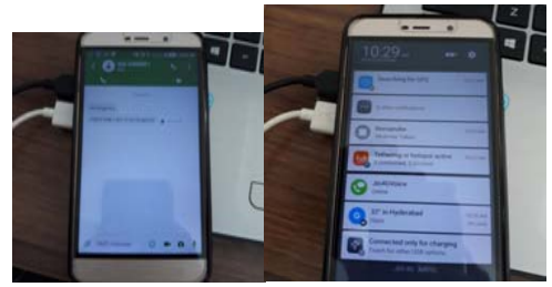
Fig 6: messages for emergency and after tabulate taken