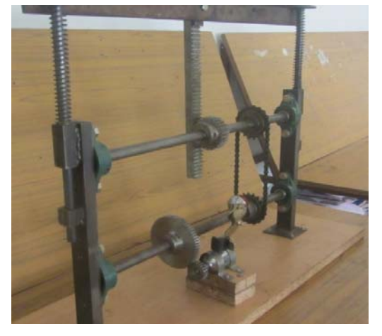
Fig 6.2 Side view of the footstep electric generator