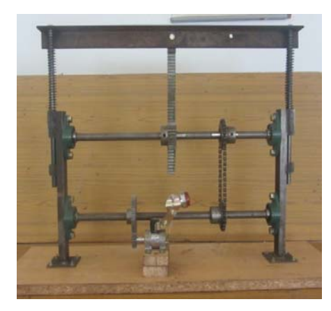
Fig: 2 Front view of the footstep electric generator