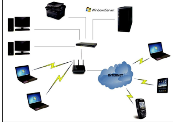
Fig. 1: Architecture of Network