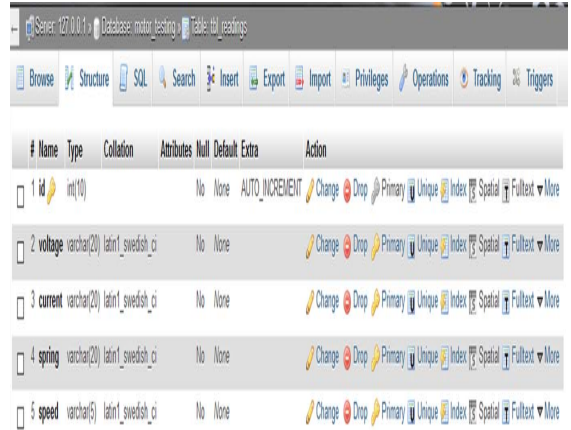
Figure 4 Table Structure to Store Motor Readings

The figure 4 shows table the readings of the motor testing which is collected by the sensor will be stored.