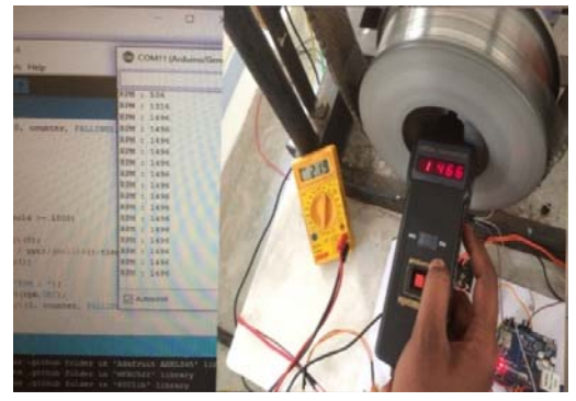
Fig 2. Demo picture of motor at high speed

The figure 2 shows the experimental setup, and the model readings of the experiments. Here the motor runs at high voltage where speed reaches about 1500 RPM, and the readings are saved and displayed in the server (LAPTOP). That value can be able to store in the server, and can be able to take it at any time.