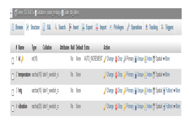
Figure 5 Table Structure To Store Temperature And Vibration

The figure 4 shows table the readings of the motor testing which is collected by the sensor will be stored.