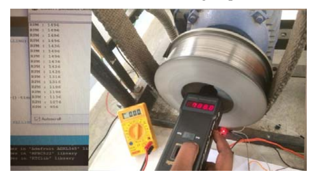
Fig 3. Demo picture of motor at Low Speed speed

The figure 3 shows the low voltage readings at low speed and the values are in digital. And then it will be transferred as analog value and again converted as digital which will store in database