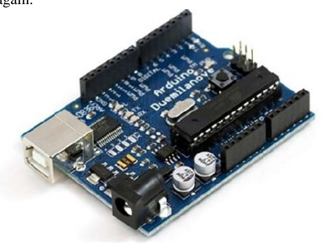
Fig.4.2 Arduino Uno microcontroller board (interface)

reset button. It contains everything needed to support the microcontroller; simply connect it to a computer with a USB cable or power it with a AC-to-DC adapter or battery to get started. You can tinker with your UNO without worrying too much about doing something wrong, worst case scenario you can replace the chip for a few dollars and start over again.