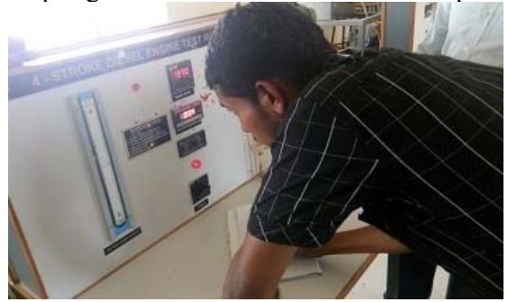
Figure 4 : Digital indicator

is measured by water for table operation and the whole setup mounted on a sturdy steel frame with vibration mounts. Initially take sample of diesel so check the diesel fuel in the diesel tank. Allow diesel, start the engine by using hand cranking. The engine set to the speed of 1500 rpm. Apply load from the mechanical dynamometer by operating the hand wheel on the spring balance of the brake drum in steps.