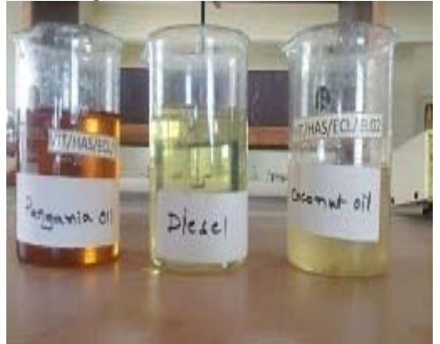
Figure 2 : Pongamia, Diesel and coconut oils Starts stirring process continuously the particles are heated at a temperature of 700c continuously after some time nearly 45 minutes to 50 minutes to maintaining the room temperature to form a methyl ester solution. But it have a mixture of mud particles and glycerol. The mixture of all have cooled into room temperature and add a some drops of HCL(hydrochloric acid) added to form a neutralized it. This mixture oil is washed