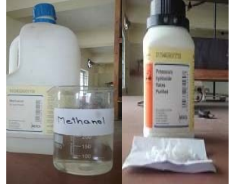
Figure 1 : methanol and KOH.

The easiest way to reduce the viscosity is transesterification process or method. In the transisterification process first vegetable oils like pongamia, sunflower oil, Mohua oil, etc., Take one litre or 1000 ml Pongamia oil is added with 300 ml of methanol in a round bottom flask. And additional to that add a 8 to 10 grams of NaOH or KOH (Potassium Hydroxide) is added into the fuel present in the round flask.