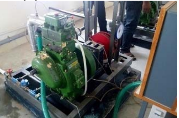
Figure 3 : Engine

The arrange is made for the following measurements of the set up : the test rig consists of 4-stroke single cylinder diesel engine, to be tested for for performance is connected to rope brake dynamometer with exhaust gas calorimeter. The arrangement is made for the following measurements: the rate of fuel consumption is measured by using the pipette reading against the known time.