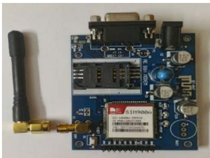
Figure. 5 - GSM Module

GSM is short for Global System for Mobile communication system. It provides three main services of short message, speech communication and data communication. Because service of short message makes the wireless communication module more popular to be used, wireless communication module is also called GSM short message module. GSM short message service has the character of always online, no dialing, low price, large coverage and etc. For GSM technology, short message service is the only one that needn't set up end-to-end channel and also provide service when the mobile device is in point-to-point communication. Short message service is asynchronous communication for sending only one sentence per each message. In GSM system, each message is handled as individual time and transmitted by SMSC (Short Message Service Center). GSM can offer speed of 9.6 Kbps data communication service when on-line whereas GPRS can offer speed of 100Kbps. Considering