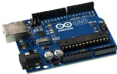
Figure. 2 Arduino-UNO

The Arduino Uno is a microcontroller board based on the ATmega328 (datasheet). It has 14 digital input/output pins (of which 6 can be used as PWM outputs), 6 analog inputs, a 16 MHz crystal oscillator, a USB connection, a power jack, an ICSP header, and a reset button. The Arduino Uno is a microcontroller board based on the ATmega328 (datasheet). It has 14 digital input/output pins (of which 6 can be used as PWM outputs), 6 analog inputs, a 16 MHz crystal oscillator, a USB connection, a power jack, an ICSP header, and a reset button. It contains everything needed to support the microcontroller, simply connect it to a computer with a USB cable or power it with a AC-to-DC adapter or battery to get started. The Uno differs from all preceding boards in that it does not use the FTDI USB-to-serial driver chip. Instead, it