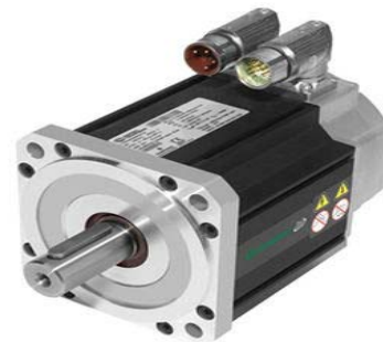
Figure.4 DC Motor

A DC motor is any of a class of electrical machines that converts direct current electrical power into mechanical power. The most common types rely on the forces produced by magnetic fields. Nearly all types of DC motors have some internal mechanism, either electromechanical or electronic, to periodically