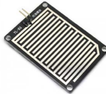
Figure.3 Water Sensor

A water sensor or rain switch is a switching device activated by rainfall. There are two main applications for rain sensors. The first is a water conservation device connected to an automatic irrigation system that causes the system to shut down in the event of rainfall. The second is a device used to protect the interior of an automobile from rain and to support the automatic mode of windscreen wipers. An additional application in professional satellite communications antennas is to trigger a rain blower on the aperture of the antenna feed, to remove water droplets from the mylar cover that keeps pressurized and dry air inside the waveguides.