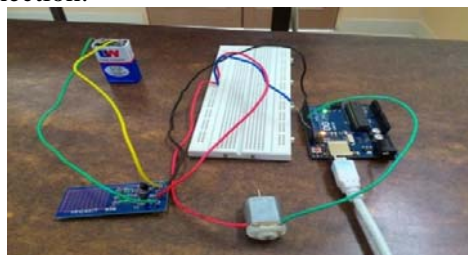
Figure. 6 Testing

The components were first connected on the bread board (since no soldering is required on the bread board), it is easy to change connections and replace the components used. By virtue of first placing the components on breadboard, the components will not be damaged so they will be available for reuse, to test how well the components will function as a unit and to transfer the connection to a board for permanent connection.