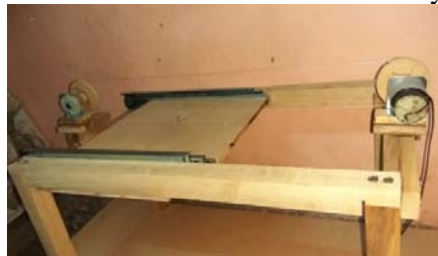
Figure 8. Side View Of The Model When Roof Is Opened

A model of an automatic slide roof was made using plywood. The scale is of ratio 1:10 and this was chosen to make the model look close to reality, for mobility sake and base on the material used for the opening system in this project. The length is 55cm, height 30cm and the width is 30cm. The materials used in joining the plywood are top-bond, glue, tack nail and pieces of woods. The roof is made of medium density sheet.