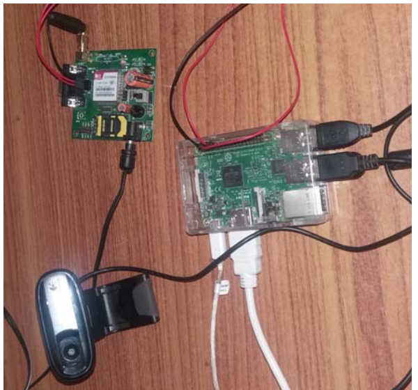
Fig 3 Interfacing of USB camera and GPRS module to Raspberry Pi

and a 'receive' signal RxD) made available on the GPIO header. To connect to another serial device, the 'transmit' of pi is connected to the 'receive' of the GPRS module, and vice versa. The Ground pins of the two devices should be connected together. On the Raspberry Pi 3 the second serial port is called /dev/ttyS0 and is by default mapped to the GPIO pins 14 and 15.