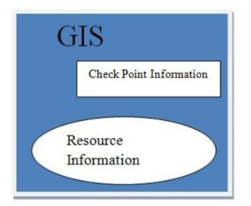
Figure 2: GIS architecture

Figure 1:Architecture of Scheduler and Grid Information System with Frie wall.