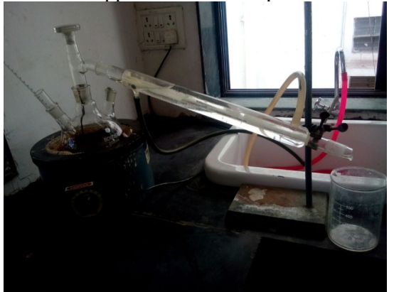
Fig.2 .1:Simple distillation assembly with oil

Distillation is a common separating technology in the chemical industry. This method separates the components successively according to their different volatilities, and it is essential for the separation of liquid mixtures. Atmospheric simple distillation, vacuum distillation, steam distillation, and some other types of distillation have been applied in bio-oil separation.