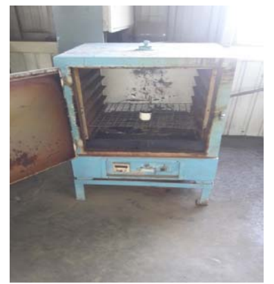
Fig.2.2:Assembly of Bio-oil taken in oven Weight of crucible=80gm Weight of oil with crucible=180gm

Oil taken=300 ml Distillate=166 ml Residue=70ml Overall loss=64ml GC-MS analysis of residue is done and also karl fisher anf calorific value is calculated. 2.Bio-oil taken in oven at 1000C