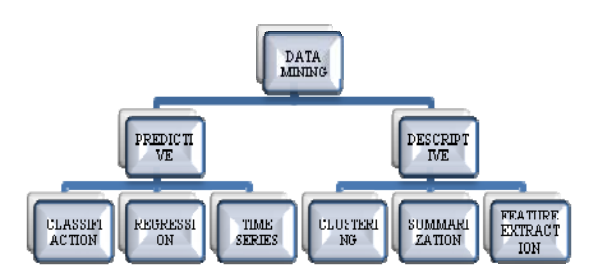
Figure-1 Data Mining Models

The main steps are for knowledge discovery stage is as follows: