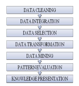
Figure-1 Stages for Knowledge Discovery

The main steps are for knowledge discovery stage is as follows: