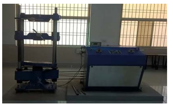
Figure 3: Experimental setup of fracture test