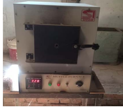
Figure 2: Electric Furnace