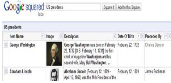
Fig. 3. Example of relational aggregated search