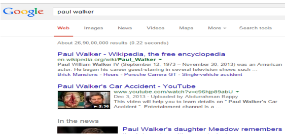
Fig. 4. Example of blended Design

M.Lalmas et al. [4] defined non-blended design, and results from each vertical represented separately in panel. Panel is also referred as tile in search engine terminology. Examples of non-blended design are alpha yahoo, Kosmix and Naver. Usually, web search results are displayed in a left side and different panel has no relationship with one another moreover placement of different panels are predefined.