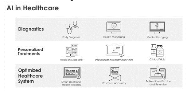
FIGURE 1. AI IN HEALTHCARE

Collaborative effort from a number of different parties involved in this matter will be required if we are going to be successful in finding answers to the issues at hand. Patients make up a significant portion of this group, along with lawmakers, regulators, data scientists, and healthcare professionals. Continuous research, regulatory frameworks that strike a balance between innovation and safety, standardized methods for data exchange, and the formulation of ethical standards are all required in order to guarantee the adoption of deep learning and AI in healthcare in a way that is both responsible and beneficial to patients.[7]