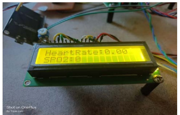
Fig 2: Displaying heartrate and spo2 values