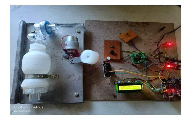
Fig 3: DC motor starts based on the spo2 level