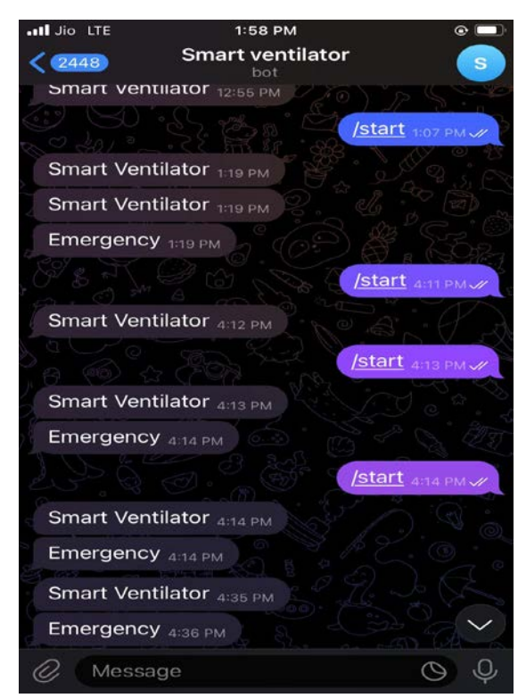
Fig 5: Doctor getting an emergency message