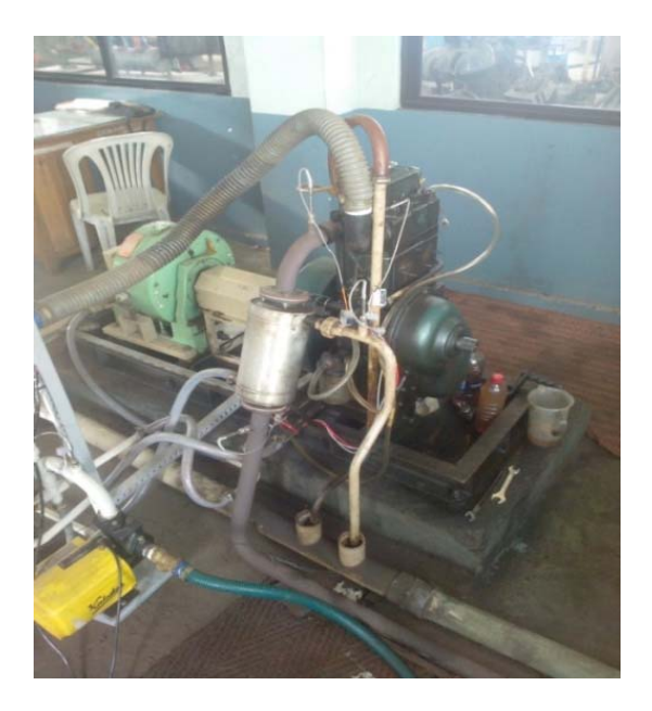
Fig. 1 Engine without catalytic converter

The catalytic converter system is installed with above engine and test will be conducted on this engine such as with catalytic converter system and without catalytic converter system. The photograph of this systems are shown below.