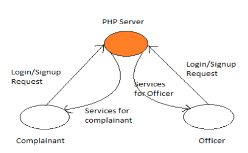
Figure 4.3 Server-App Interaction