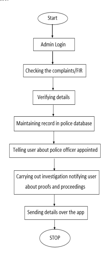
Figure 4.1 Flow graph for the officer

System's Android application. The complainant is supposed to create an account to access the application. Once the complaint has been registered the police officials are able to see those on their side of the application. Police officers too are required to have a unique account. The cases are assigned to the officers. They can make updations and provide details of the progress on a particular case. These details are available for the complainant on his app which he could check by logging into his account.