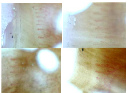
a)&b) Normal c)&d) Hypertensive Figure2: Sample Nailfold Capillary images

Informed consent is obtained from the controls as well as the patients. Figure 2 shows some sample Nailfold capillary images.